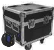
Flightcase with charger