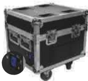
Flightcase x4 units