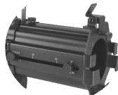
Zoom Barrel Lens 19° - 36°